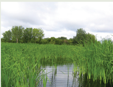
HABITAT / PLANTS / WETLANDS 0 plants, shrubs, and trees planted.