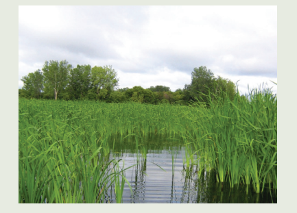
HABITAT / PLANTS / WETLANDS 0 plants, shrubs, and trees planted.