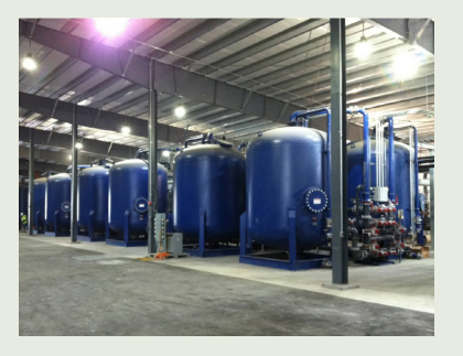
WATER TREATED Completed